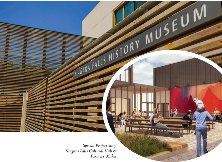
Special Project 2019: Niagara Falls Cultural Hub & Farmers' Market

Niagara Falls has a plethora of indoor and outdoor recreation opportunities for families, businesses and visitors. Niagara Falls parks, trails, and gardens are easily accessible for biking, hiking, and walking along with the Gale Centre, the city's indoor 4-pad arena and McBain Centre, containing pools and fitness facilities for the community to enjoy.