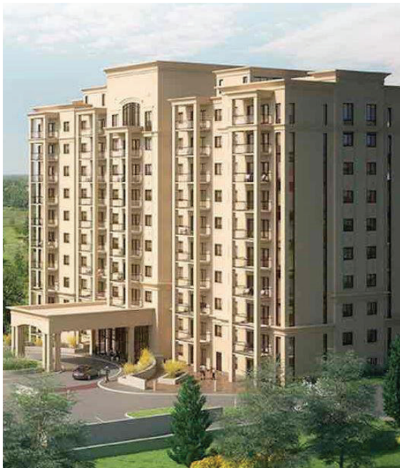
Check out the Niagara Falls Business Annual Report 2019 for the latest updates on proposed, current, and completed housing projects.

In 2018 there were a total of 37,265 households in Niagara Falls. In Niagara Falls there is a wide selection of rental apartments, most in low-rise buildings. More importantly, housing prices are substantially lower than nearby Toronto and Oakville allowing for a potentially higher quality of life, as home ownership is far less costly. The average monthly rent for a one-bedroom apartment in October 2019 was $875, a two-bedroom apartment was $1,000, and a three-bedroom apartment was $1,200. Less money spent on rent allows for a greater disposable income. For many, homeownership is important. In Niagara, the average house price in 2019 was $385,000. This means that living in Niagara Falls can be extremely cost effective compared to communities in the GTA, and is just one more compelling reason to relocate a company to Niagara Falls.